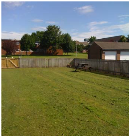
Outdoor play area